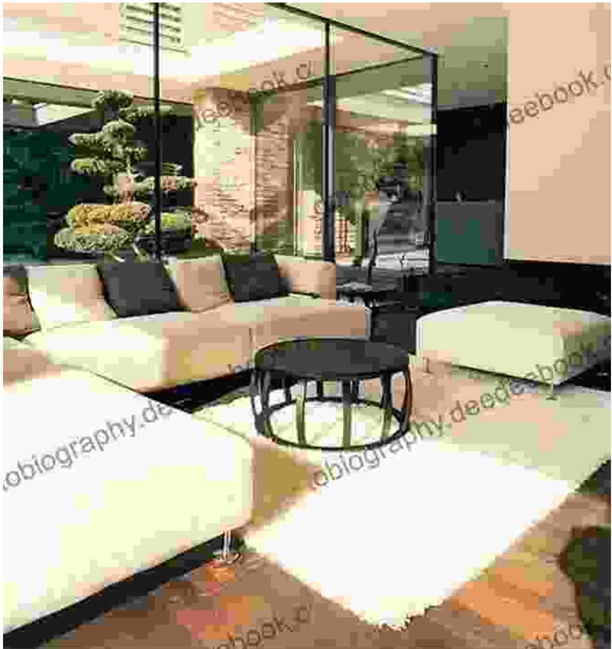
Image Description: A modern Japanese-inspired living room with open space, natural materials, and a minimalist aesthetic.