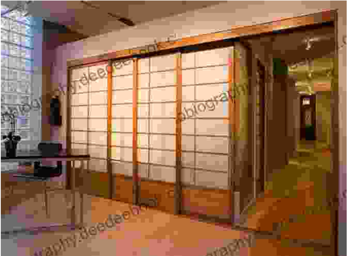
Image Description: A traditional Japanese house with sliding doors, a raised platform, and a simple rectangular shape.