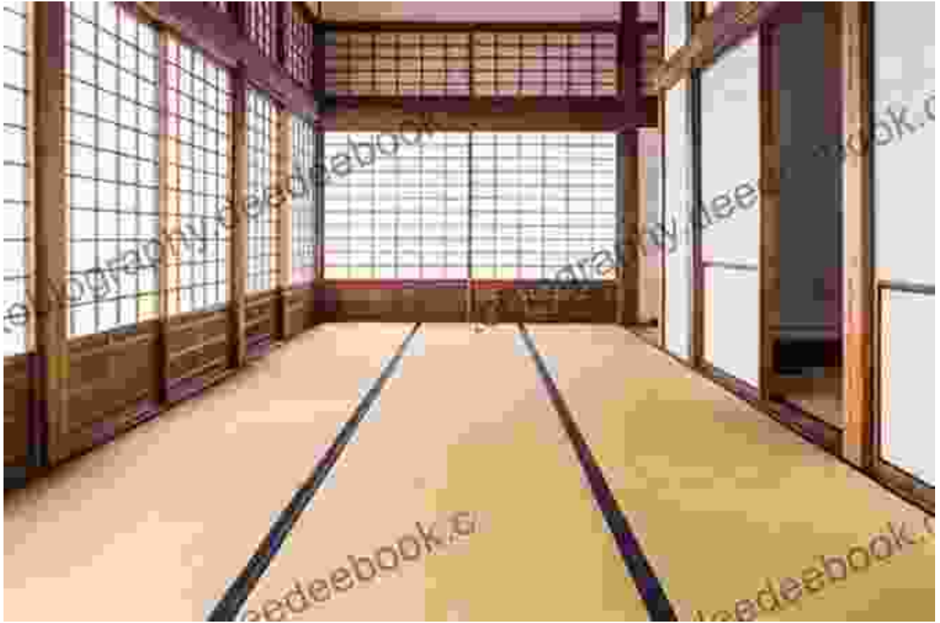
Image Description: A traditional Japanese tea room with tatami mats, paper shoji screens, and a simple tea set.