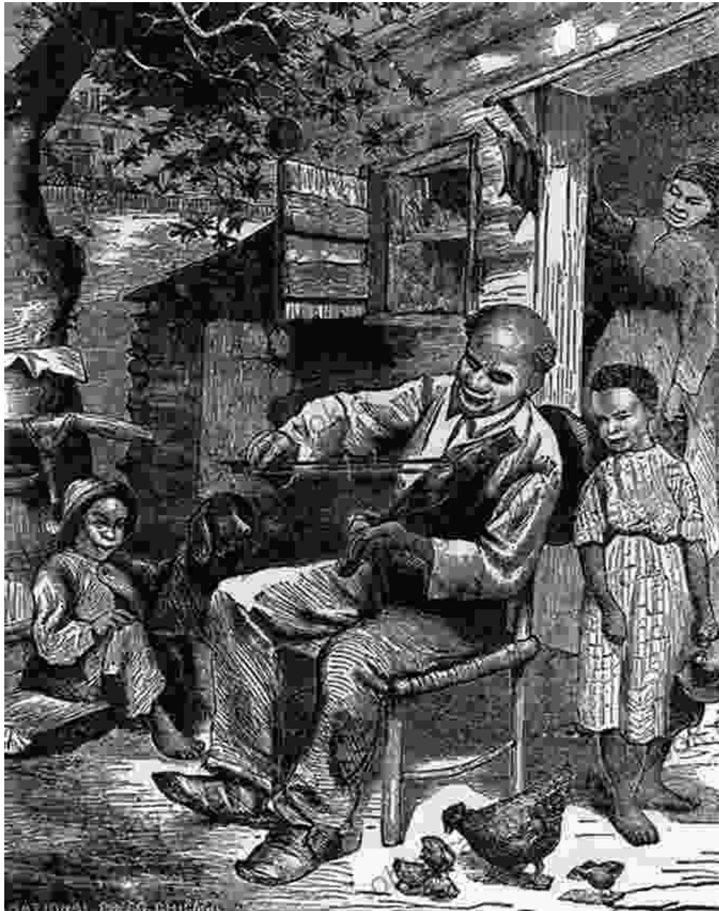
The Journal of Darien Dexter Duff, an Emancipated Slave (Louisiana 1865) (PLANTATIONS and PIRATES)