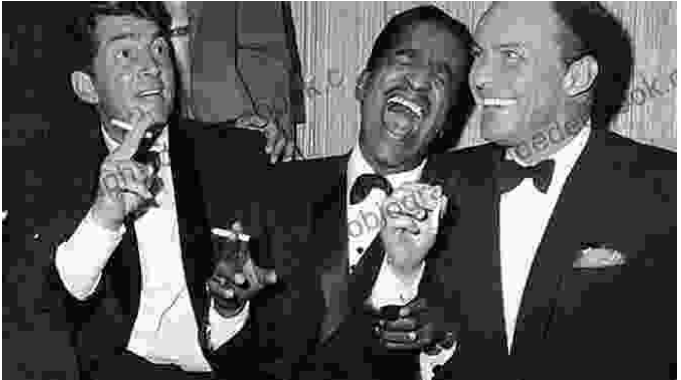
Sammy Davis Jr. with the Rat Pack