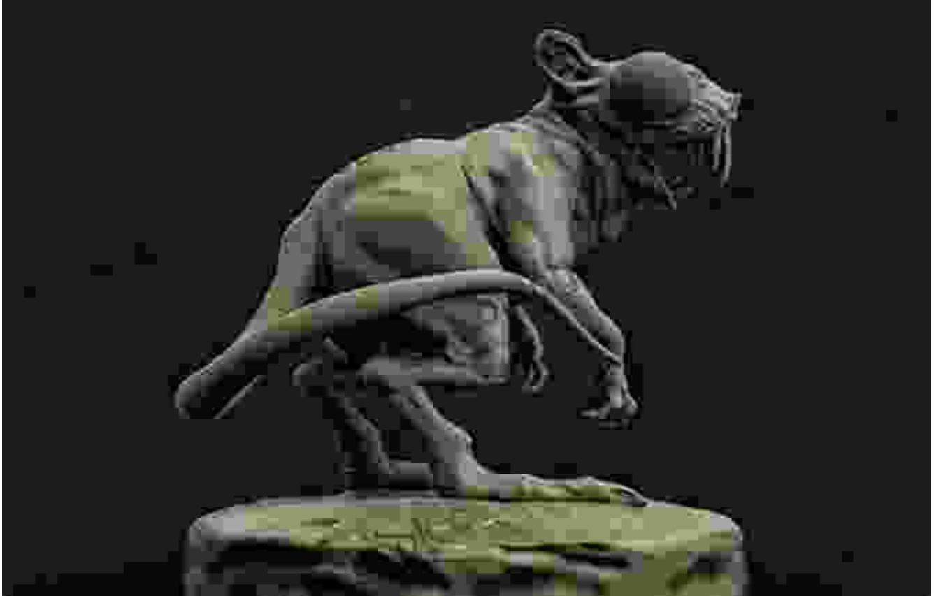
Figure 2: A distorted and enigmatic creature, a testament to the Shimmer's power to alter life.