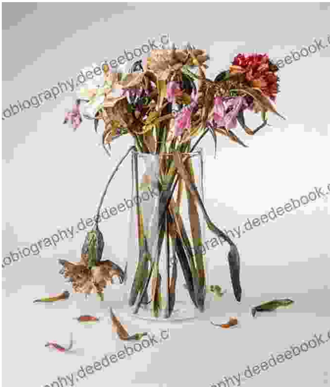
Figure 4: A visual metaphor for the fading of life and the passage of time.

are constantly shifting and evolving, and that even the most vibrant and resilient of us will eventually fade away.