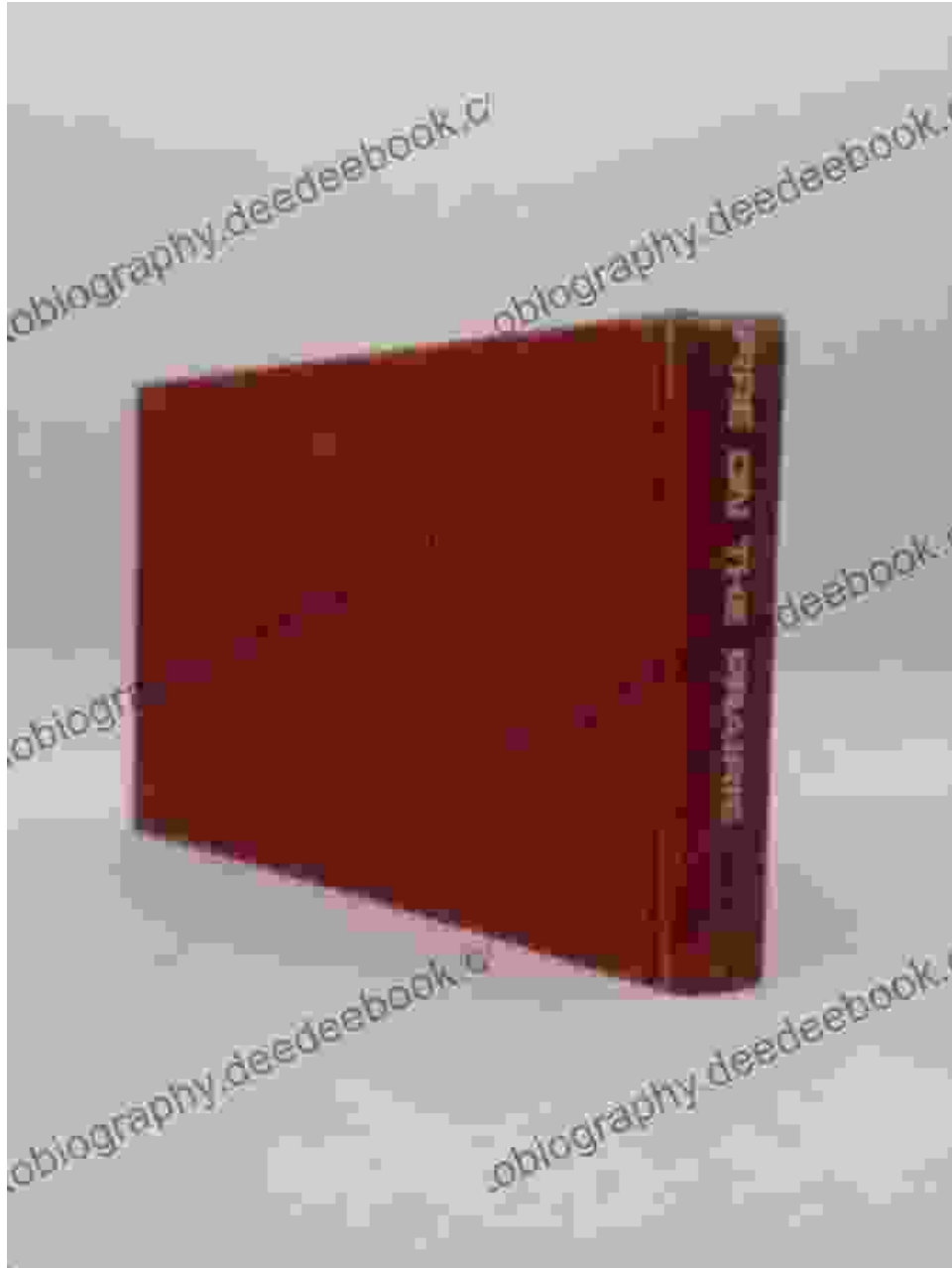
The cover of Laura Ingalls Wilder's novel Fire on the Prairie.